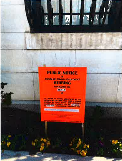
1/6/20 Dupont Circle NW